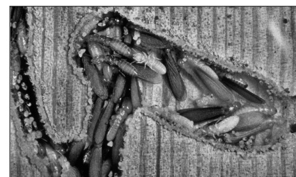
Drywood termite gallery: direct treatment to galleries can eliminate infestations at the source using inexpensive treatment tools