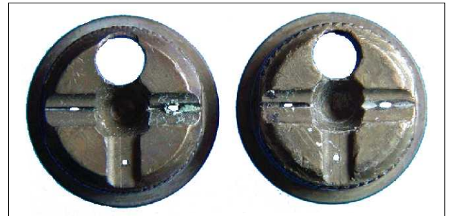
Worn tips over-apply chemical which cuts profit without killing more pests

If it is 2 years old the opening has become larger (brass is a soft metal) and you are spraying more liquid than you need—and that’s costing you money.