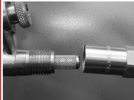
Get more life out of your valve and tip with periodic cleaning of your mesh screen

When’s the last time you did that? Keep this clean and it will keep the valve clean.